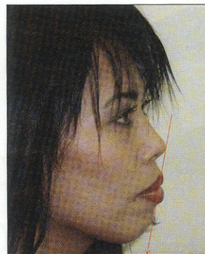
Figure 7. The use of Ricketts e-line for lip profile evaluation.

Figure 7. This view can also be used to confirm or assess lower-third symmetry. As we know, the teeth support the lips and lower third of the face, and a restorative decision can have a dramatic effect on the patient's appearance. If the clinician or the patient notices excessive protrusion or retrusion, a mark will be made on the drawing. Then a decision has to be made as to whether the correction can be made with restorative dentistry alone, or if a referral to a specialist (orthodontist or oral surgeon) will be appropriate.