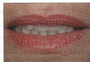
Figure 9. New "conversational tooth reveal" photographic view records the amount of tooth reveal or show during a conversation.