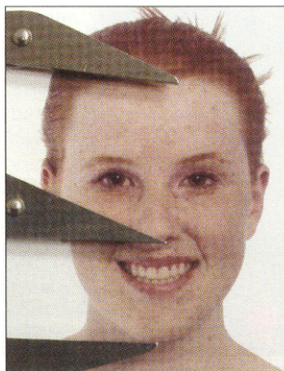
Figure 4. Evaluation of the lower facial third, using the Golden Proportion ruler.