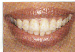
Figure 8. The unretracted natural smile used to evaluate tooth show, buccal corridor, gingival show, and incisal plane to lower lip plane.