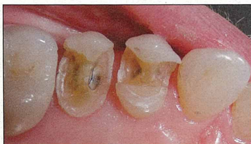
Figure 3. Tooth left after amalgam and caries removal with a 2.0 mm occlusal reduction of the lingual cusp.