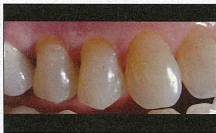
Figure 5. Buccal view of finished bonded onlays (IPS Empress [Ivoclar Vivadent]) with excellent aesthetic results.

in order to expose subgingival tooth structure so the margin can be placed below the gingival tissues; this is followed by a second cord to make a proper impression of the subgingival margin; and, of course, subgingival impressions carry their own challenges with them. 5 If this is not difficult enough, the cementation procedure has its own challenges as well. First, it is not uncommon to see that, after the provisional is removed from this subgingival preparation, the gingiva is inflamed and bleeds easily. This is usually the consequence of a less-than-ideal provisional and less-than-ideal oral hygiene at home on the part of the patient. Fragile, bleeding gums pose difficulties in achiev-