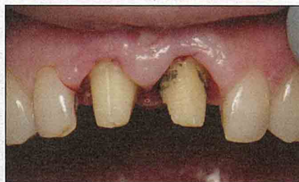
Figure 8. Observe the traditional tooth preparation required for full crowns.