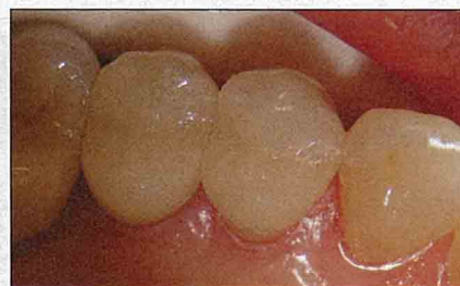
Figure 6. Finished bonded onlays.