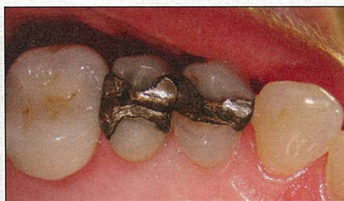
Figure 2. Observe the existing large amalgams with leakage and secondary caries.