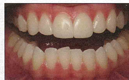
Figure 11. Finished maxillary central veneers. Note the excellent aesthetic blend at the margins, achieved by using the proper translucent porcelain (Noritake CZR Layered porcelain veneers [Kuraray America] by Burbank Dental Lab).

Bases/liners and/or composite resin dentin build-up materials can be used as a biological protection for deep areas and as dentin replacement underneath supragingival restorations (Figure 4). These base materials (Tetric EvoCeram [Ivoclar Vivadent]) can reduce the volume of an onlay to less than 4.0 mm, ensuring that one can adequately light cure the cement at placement of the final restoration, and fill in internal undercuts in an effort to retain nonworking cusps.