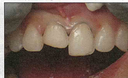
Figure 10. Observe the minimally invasive supragingival veneer preparations.