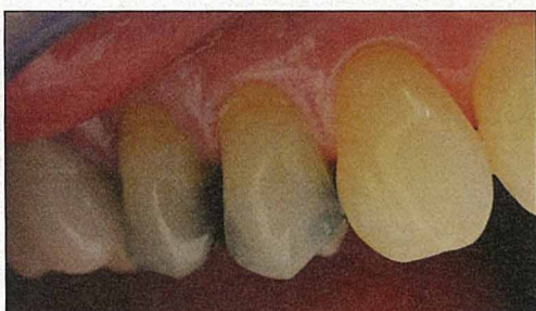
Figure 1. Buccal appearance of existing amalgams.