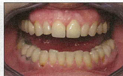
Figure 7. Two maxillary centrals restored with full crowns with subgingival margins (a different patient). Note the traditional unhealthy looking tissues.