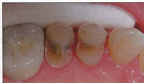
Figure 4. Buccal cusps have been repaired with undercuts and weakened enamel, restored with bonded composite.